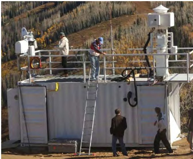
AMF2 radar SeaTainer

The second ARM Mobile Facility (AMF2) consists of three 20-foot modified "SeaTainers" and other smaller modules, which contain radars and other instrumentation.