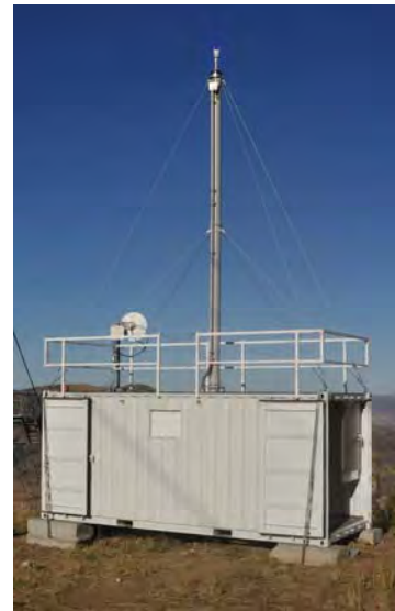
AMF2 aerosol SeaTainer